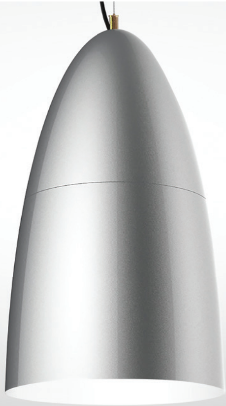
OSPB 24", 36" or 42" shade height