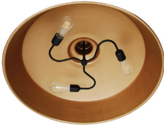
3-Light Curved Arm Cluster