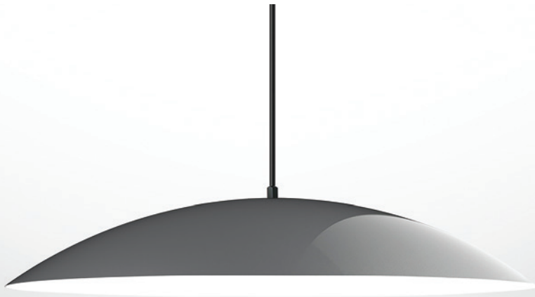
OSDC 24", 36", 42" or 48" shade width