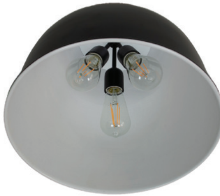
3-Light Straight Arm Cluster

Optional clusters are decorative and will also increase light levels.