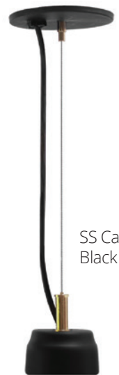
SS Cable with Black Cord

Stainless steel cables are required on some shade sizes and optional on all others.