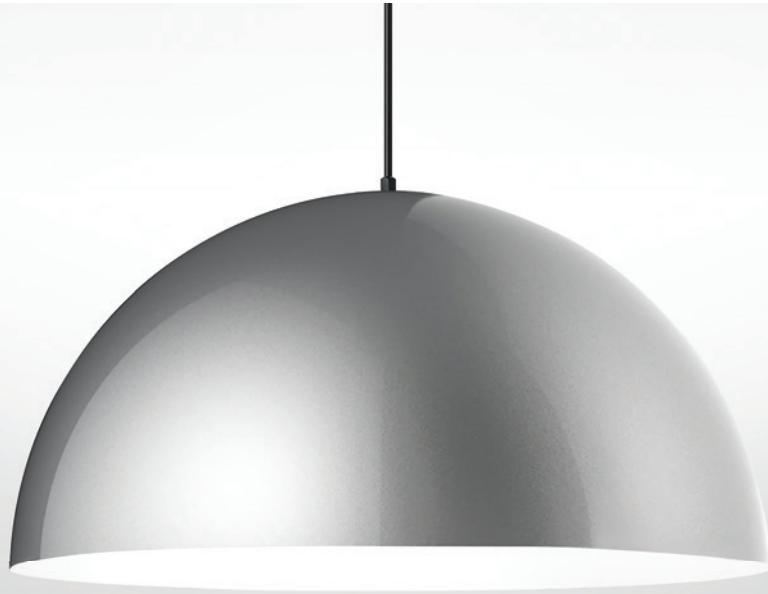
OSSD 24", 30", 36" or 42" shade width