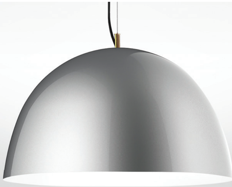
OSDD 22", 30" or 36" shade width