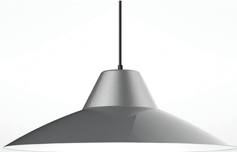
OSAC 24" or 36" shade width