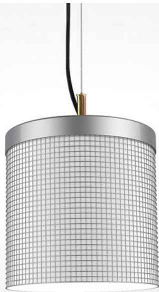
OSOC 20" shade width

13 Styles in Various Sizes | Unlimited Finishes | Glare-free Illumination | Made in America