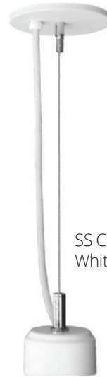
SS Cable with White Cord