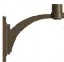
WM5161 / 15 3/4" x 17 3/4"