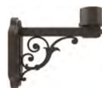
WM5311 / 10 7/8" x 10"