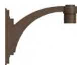
WM5163 / 15 3/4" x 13 3/4"