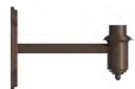
WM5603 / 17 7/8" x 14"