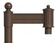
PA8523 / 18 1/4" x 14 1/2"