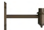
WM5601 / 17 7/8" x 14"