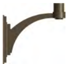
WM5161 / 15 3/4" x 17 3/4"