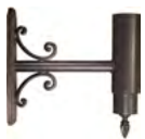
WM3351 / 14 1/2" x 17"

See Wall Mount Section on Website for Specification Sheets and additional wall mount arms. Dimensions are Projections x Height. Click here for all Wall Mount styles