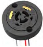
TL5 & TL7