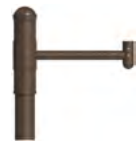
PA3321 / 18" x 14 3/4"