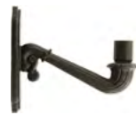
WM8831 / 17 1/4" x 16 3/8"