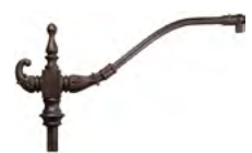
PA8453 / 70" x 37 1/2"