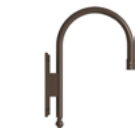
WM1773 / 20" x 30"