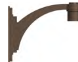
WM5163 / 15 3/4" x 13 3/4"