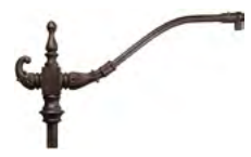
PA8453 / 70" x 37 1/2"