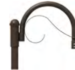
PA2023 / 21 1/4" x 16"