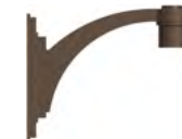
WM5163 / 15 3/4" x 13 3/4"