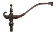
PA8453 / 70" x 37 1/2"