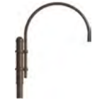
PA2613 / 39 1/2" x 46"