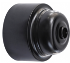
RTCW (6 1/2" OD x 5 5/8" H) Wall Only (E-arms)