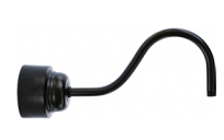
E36 | 23 1/4" x 8"