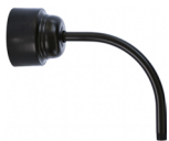
E15 | 16 3/8" x 10 1/2"

Dimensions are Projection x Height | CB included with all arms Click here for all Arm Mount styles