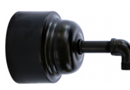
E22 | 10 1/2" x 4 1/2"