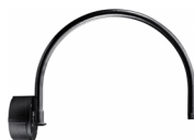
WM54 | 23 3/8" x 18"