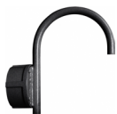
WM40 | 13 7/8" x 14 3/4"

Dimensions are Projection x Height Click here for all Wall Mount styles