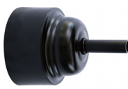
E20 | 10" x 4 1/2"