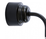
E26 | 11 1/8" x 6"