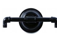
E23 | 9" x 4 1/2" x 11 1/2"