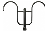
PM40 | 43 3/8" x 28"