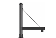
PM319 | 16 5/8" x 27 1/2"