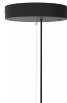
DCCEM (12" x 1 1/2") Cable/Cord Only