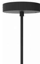
DCCEM (12" x 1 1/2")