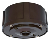
RTCNC (5 7/8" OD x 2 5/8" H)