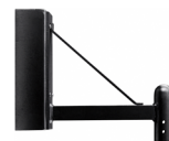
WM317 | 15" x 12 3/4"