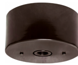
SRTCC (6" OD x 2 7/8" H)