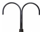
PM20 | 30 1/8" x 25"