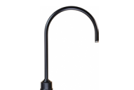
PM10 | 14 1/2"

Dimensions are Projection x Height Click here for all Post Mount styles