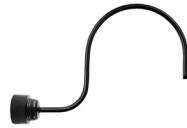
E18 | 30 3/4" x 21 3/8"