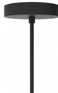
DCCEM (12" OD x 1 1/2" H)

► UP TO 30W MAX ► CL = Clear ► FR = Frosted ► PR = Prismatic ► 100 = Small ► 200 = Large