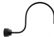
E18 | 30 3/4" x 21 3/8"