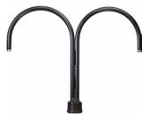
PM20 | 30 1/8" x 25"