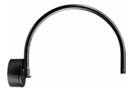
WM54 | 23 3/8" x 18"