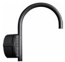
WM40 | 13 7/8" x 14 3/4"

Dimensions are Projection x Height Click here for all Wall Mount styles