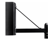
WM317 | 15" x 12 3/4"