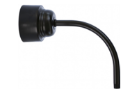
E15 | 16 3/8" x 10 1/2"