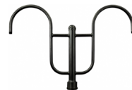
PM40 | 43 3/8" x 28"