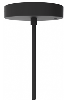
DCCM (12" OD x 1 1/2" H)