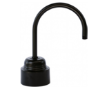
E39 | 13 1/2" x 15 1/8"